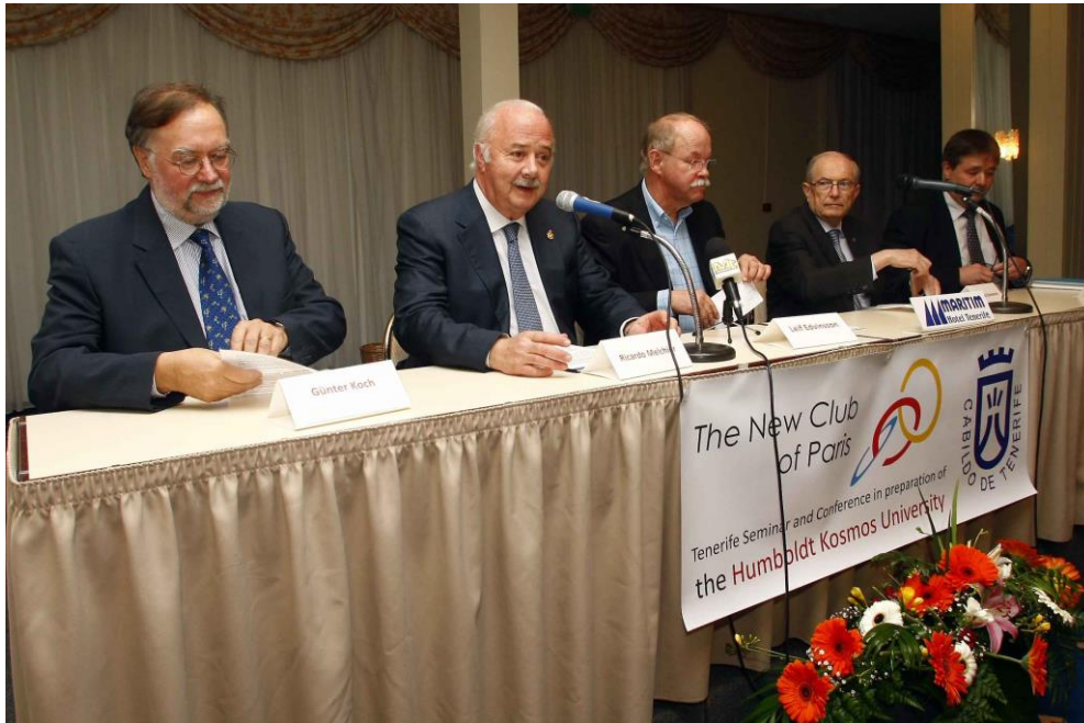
Inauguration in February 2012